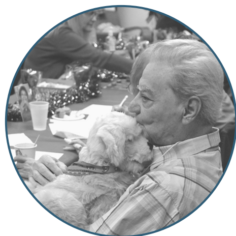
A Mike's Place client cradles an animatronic dog made by toymaker Hasbro. The lifelike "pets" provide comfort and companionship for older adults.

Toymaker Hasbro recently donated their animatronic "Joy for All" companion dogs and cats to Meals on Wheels programs across the country, including MOWCTX. Mike's Place clients love interacting with the life-like creatures that are a practical alternative in situations where a owning a real pet isn't possible.