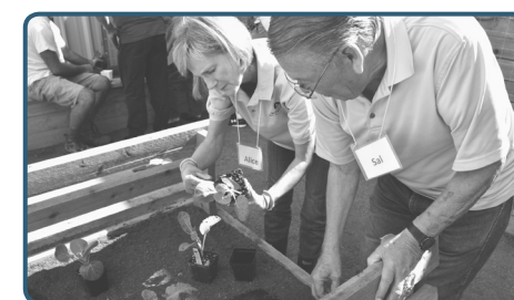
Mike's Place clients and volunteers will tend the vegetables in our new Senior Sunshine Garden. Our kitchen staff will then turn the veggies into healthy meals for Mike's Place participants.

Thanks to a generous donation from the St. David's Foundation's Health's Angels, we were able to create the Senior Sunshine garden which will be tended by